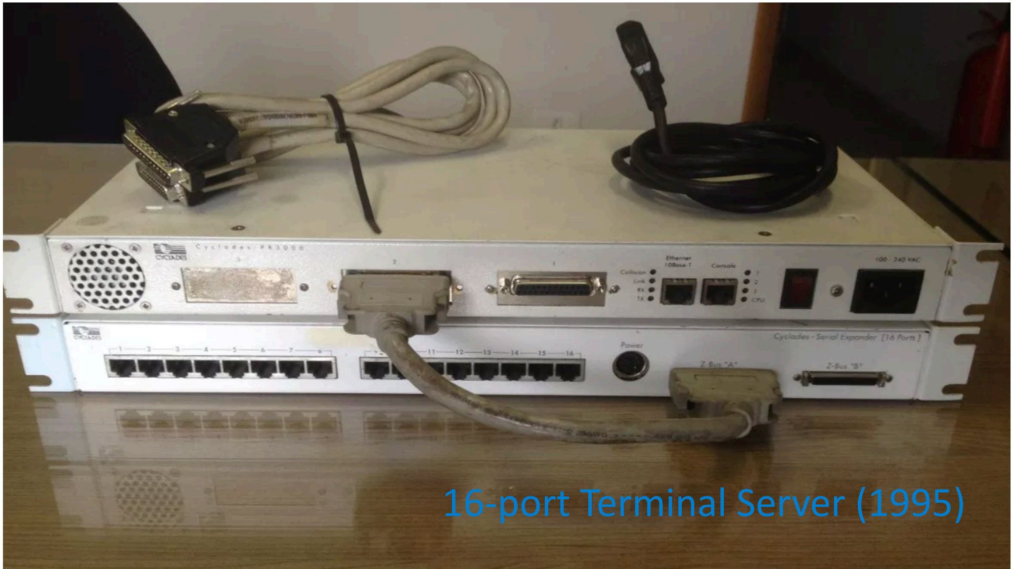
16-port Terminal Server (1995)